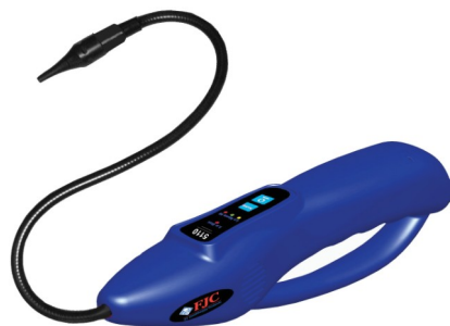
Part # 5110 FJC Electronic Leak Detector

Always follow Local, State and Federal laws when performing service on an Air Conditioning System.